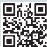
Scan here to log into Mobile Banking

Manage your finances anytime from anywhere without traveling to a branch or being tied to your computer. When you are on the road, at a sporting event, or just out hiking... Mobile Banking allows you to: